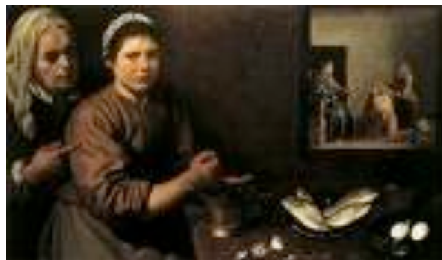
Martha of Bethany being consoled by her mother in the kitchen with Mary listening to Jesus in the front room.