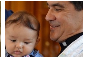
Arrange for Baptism or Confirmation