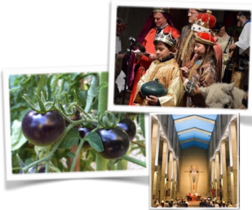
Earth & Altar ~ An active exploration of our relationship with God, earth and one another.