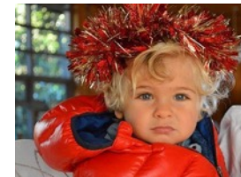
Enroll in Christian Education