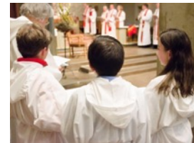
Get on the mailing list, and get involved!