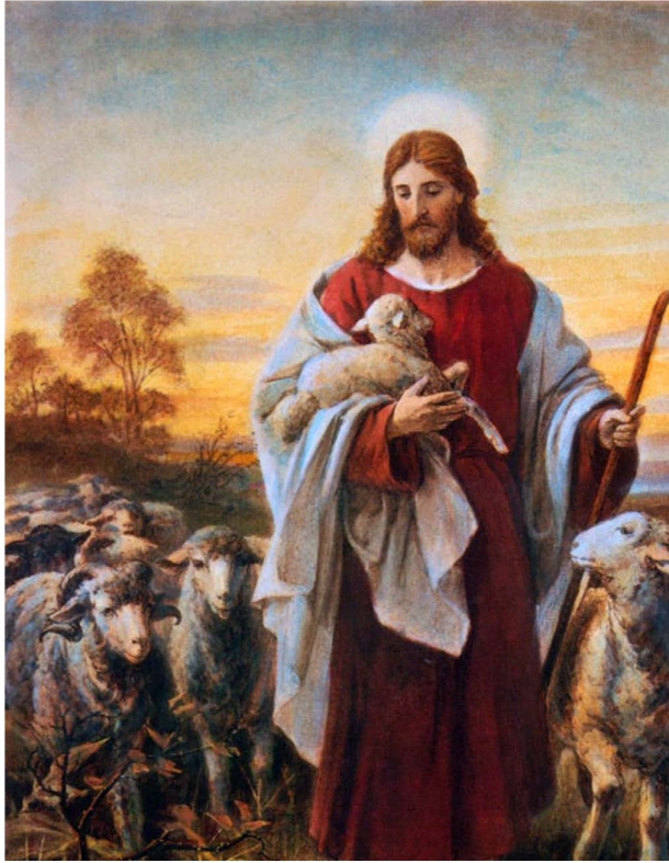
Bernhard Plockhorst, The Good Shepherd , 1878